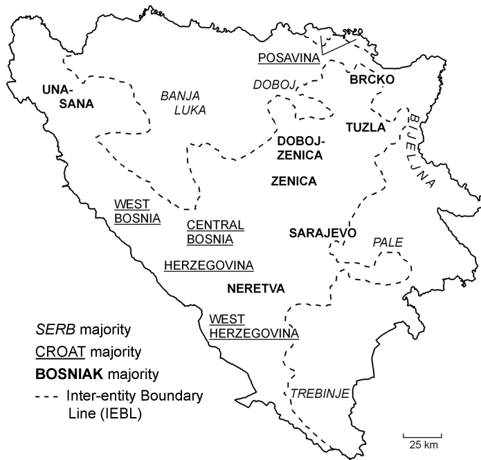
Fig. 2. Sample regions in Bosnia-Herzegovina.

negative, attitudes presumably linked to the fact that it institutionalized two and not three entities.