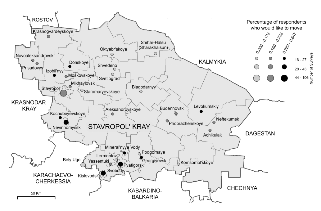
Fig. 3. Distribution of responses to the question of whether the respondent would like to move in the next two years in the 32 sampling points of Stavropol' Kray. Mean response is 29.6 percent.