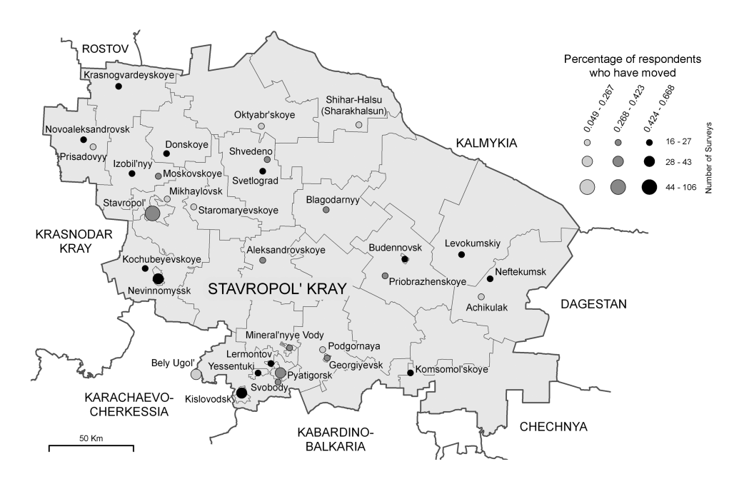
Fig. 2. Distribution of responses to question of whether the respondent has moved since 1990 in the 32 sampling points of Stavropol' Kray. Mean response is 38.4 percent.

some sense of the possible impact of tense inter-ethnic relations, we included Russian nationality as a variable, as well as measures of the current state and trend in ethnic relations as perceived by the respondent. Although we expected those respondents who reported a poor state of ethnic relations to be more likely to move in the future, the expected relationship with past moves was not evident. Finally, we included two measures that summarized personal conflict experiences (i.e., whether the respondent's life was influenced by the regional conflicts) and the respondent's overall view of the social, economic, and political situation in the kray. While there are clear expectations that people are more likely to move from negative situations, the relationship with previous moves is less clear because the current residence may not represent much of an improvement.