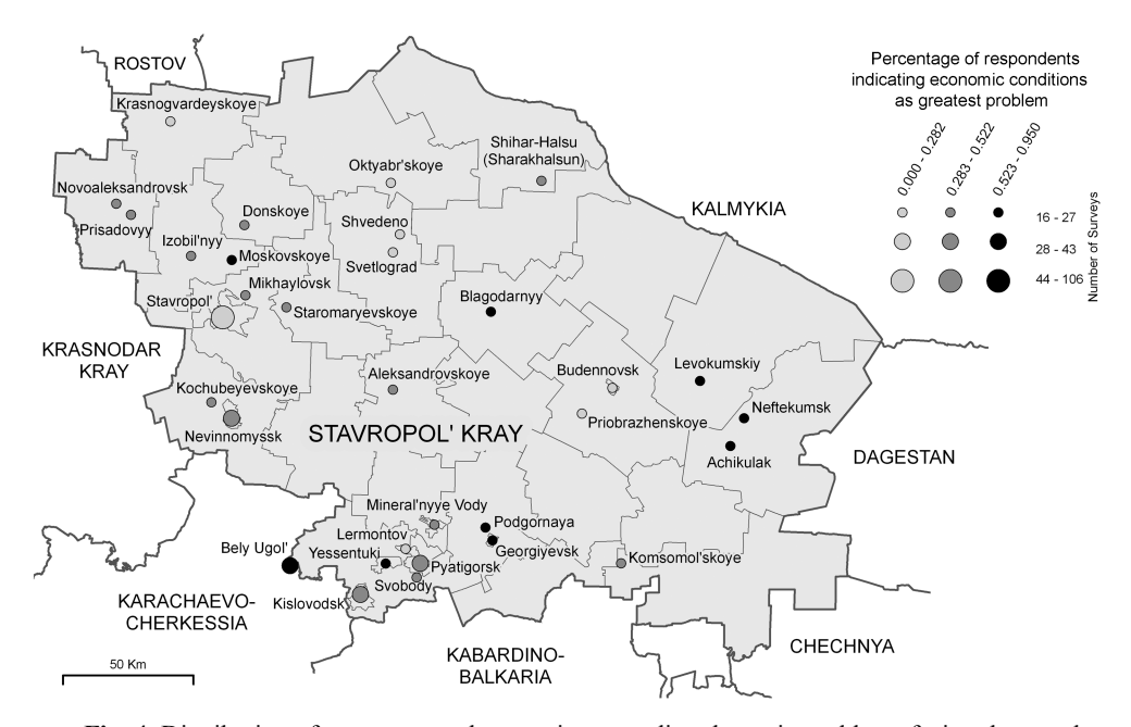
Fig. 4. Distribution of responses to the question regarding the main problems facing the peoples of the North Caucasus. The map shows the average response in the 32 sampling points of Stavropol' Kray to the option "lack of economic development." The mean response for the entire kray is 47.5 percent.